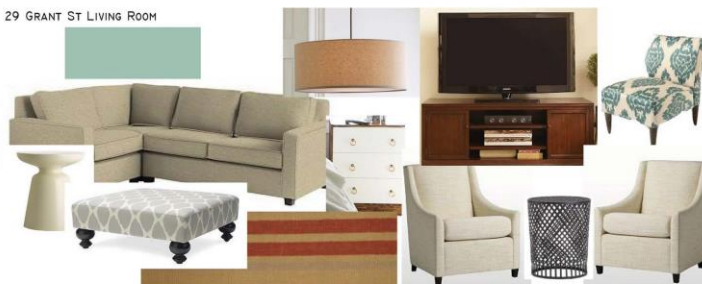
29 GRANT ST LIVING ROOM

Habitat for Humanity 1026 Park Ave, SE Aiken, SC 29801 (803) 642-9295 https://www.habitataiken.org